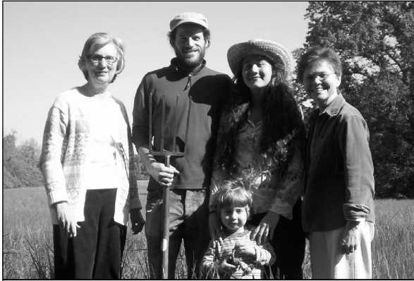
Learning Center Staff and Our Farm Family